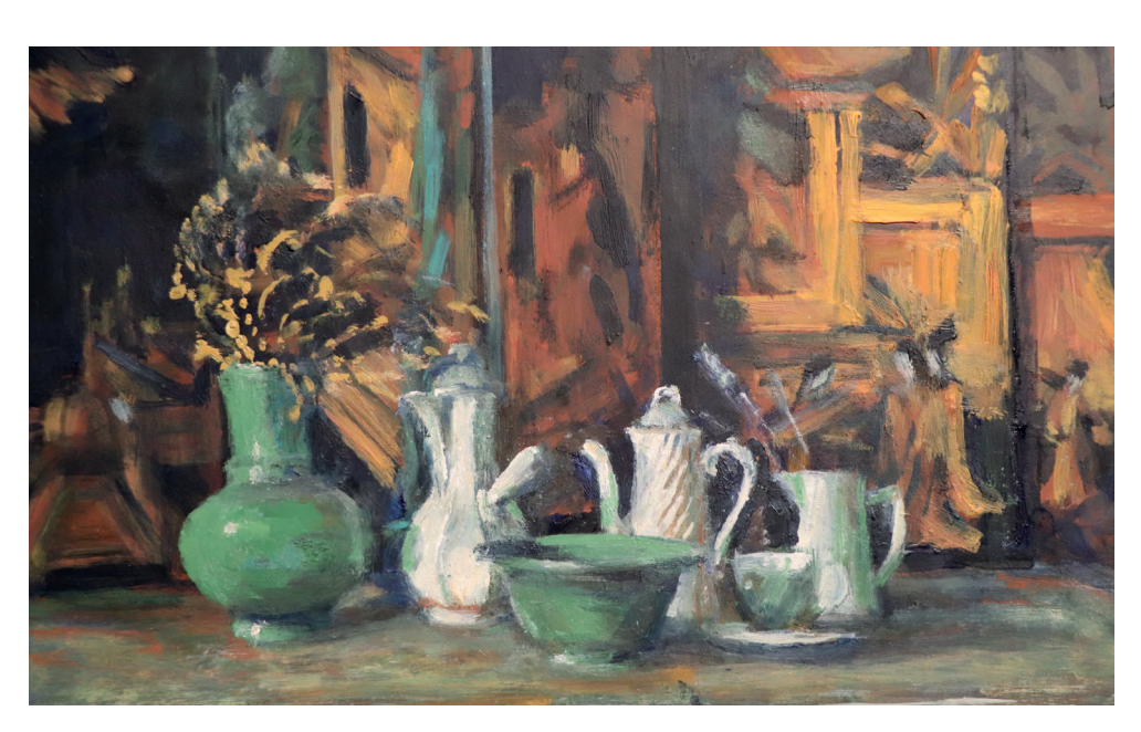
RIGHT: This detail from Chinese screen and yellow room 1996 shows the exquisite use of paint suggesting the figures on the screen, a sweep of flowers and the reflective and patterned surfaces of the vessels.