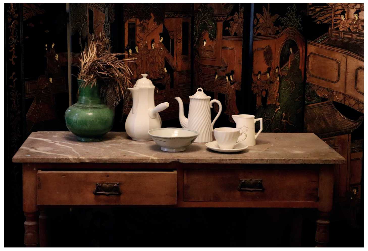
ABOVE This month's still life challenge inspired by Olley's Chinese screen and yellow room 1996.

For this challenge we have focussed on Olley's beautiful arrangement of objects in front of the of the black and gold screen. The green jar, the fluted tea cup and jugs, and delicate handles on the marble topped table add colour and pattern to the setting. We have so enjoyed recreating this scene for you. Whether you paint, draw, photograph or sculpt, we can't wait to see what you do!