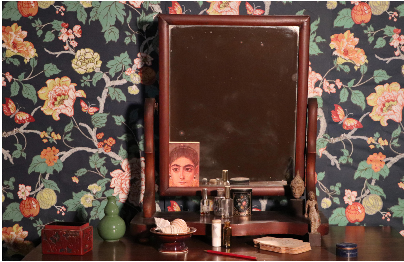
ABOVE This month's still life challenge inspired by Olley's paintings and wallpaper

This month's still life challenge is inspired by wallpaper from Margaret Olley's bedroom, and inspiration for a number of her paintings. For this challenge we have coupled the wallpaper from Olley's bedroom with other objects from her home studio collection, including her mirror, postcard, decorative red box, green vase, shells and perfume bottles.