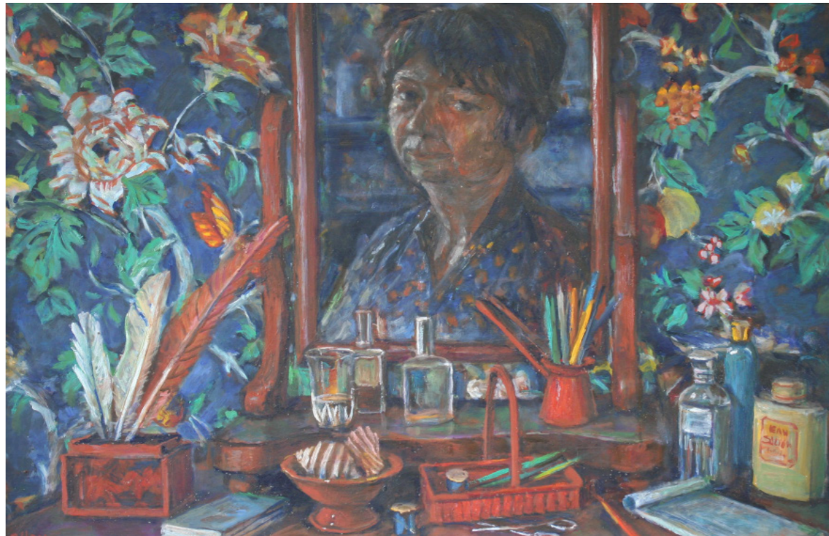
Margaret Olley (1923 – 2011), Bedroom still life 1997, oil on board, 61 x 91cm Maitland Regional Art Gallery Collection Purchased by the Art Gallery Society, 1998 © Margaret Olley Art Trust

Our third challenge is inspired by the painting Bedroom still life , 1997. In this painting Olley has used wallpaper to form an intriguing background. Far-reaching branches, flowers and butterflies frame the mirror that captures Olley's reflection, turning this still life into a self-portrait. This striking, hand-printed wallpaper that lined her bedroom walls is the focus of this month's challenge. Bedroom still life 1997 will be on display at the Maitland Regional Art Gallery in the exhibition Hello Again...it's nice to see your face , 8 August 2020 – 14 February 2021.