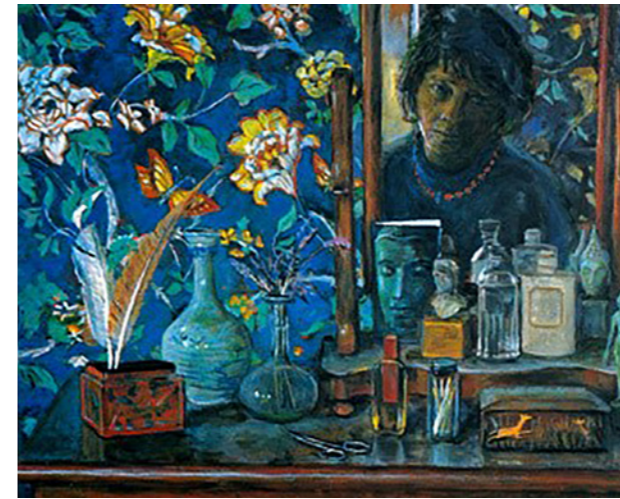
LEFT Margaret Olley Dressing table 1982 oil on board 76 x 101.5 cm Private collection

This month's still life challenge is inspired by wallpaper from Margaret Olley's bedroom, and inspiration for a number of her paintings. For this challenge we have coupled the wallpaper from Olley's bedroom with other objects from her home studio collection, including her mirror, postcard, decorative red box, green vase, shells and perfume bottles.