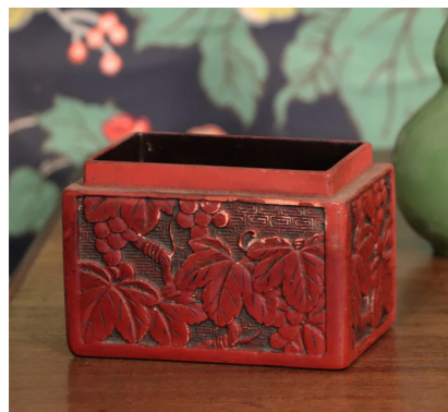
LEFT Margaret Olley's decorative red box featured in a number of her paintings and has been included in this month's still life challenge

Our third challenge is inspired by the painting Bedroom still life , 1997. In this painting Olley has used wallpaper to form an intriguing background. Far-reaching branches, flowers and butterflies frame the mirror that captures Olley's reflection, turning this still life into a self-portrait. This striking, hand-printed wallpaper that lined her bedroom walls is the focus of this month's challenge. Bedroom still life 1997 will be on display at the Maitland Regional Art Gallery in the exhibition Hello Again...it's nice to see your face , 8 August 2020 – 14 February 2021.