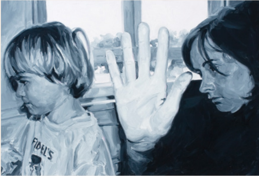
Image Credit: Julie Fragar Fidel's #2 2005 Oil on board 40 x 60 cm Collection of the Artist