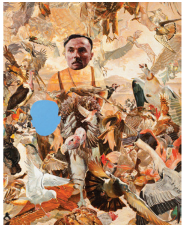
Image: Julie Fragar Second Consideration After The Fact 2014 Oil on board 150.5 x 122.5 cm Monash University Collection. Purchased by the Faculty of Science 2015.

Find one work in the exhibition that you think is more biographical and one work that is more autobiographical. For both works, say why they are more one than the other. You should then describe how each also has aspects of the other, ie. what you can see in a primarily biographical work that could also be considered autobiographical and visa versa.