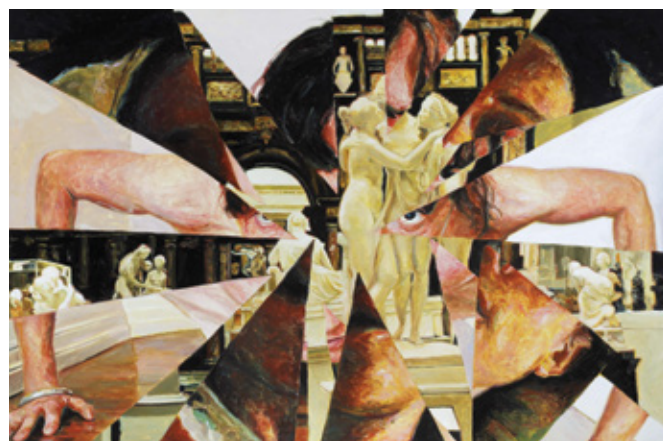
Image: Julie Fragar Kind of Woman 2010 Oil on board 90 x 135 cm Private Collection

In each case Fragar is conscious of the difference between painting and photography and in what one medium can offer to the other. For example, in some cases a photographic aesthetic (black and white or the bright light of a flash for example) might lend a sense of everyday life or reality to a painting; a useful device in a painting practice concerned with lived human experience. Painting can also offer the photograph a slowing of time and of increased contemplation or longevity of an image. In this way Fragar follows the tradition of early 1960s and 70s pop and photorealist artists who sought to understand the role of painting after photography; and as a contemporary artist, the role of painting after digital photography.