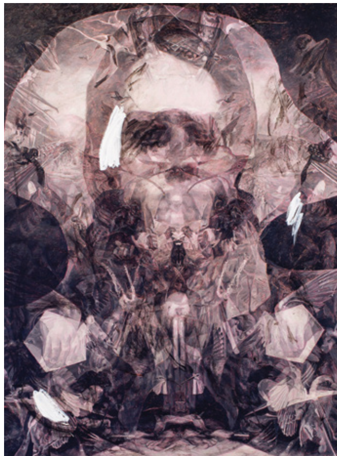
Image: Julie Fragar Goose Chase: All of Us Together Here and Nowhere 2015 Oil on board 160 x 122 cm Gift of the Art Gallery of South Australia Contemporary Collectors 2018, Art Gallery of South Australia

What effect do the white scribbles in Goose Chase have on you when you view the painting?