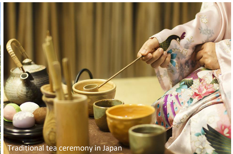
Traditional tea ceremony in Japan