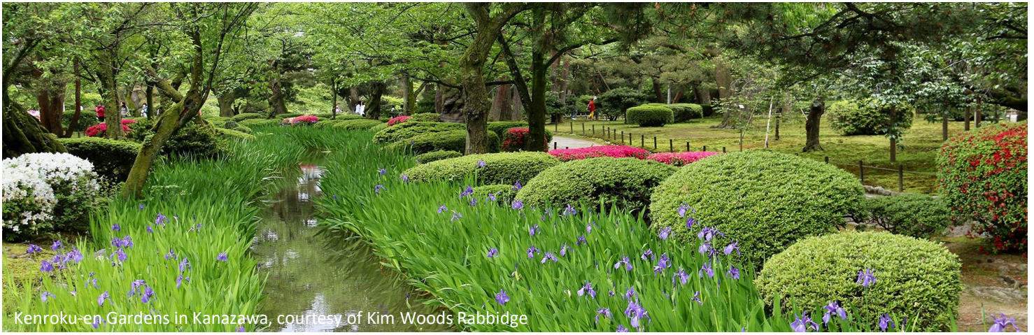
Kenroku-en Gardens in Kanazawa