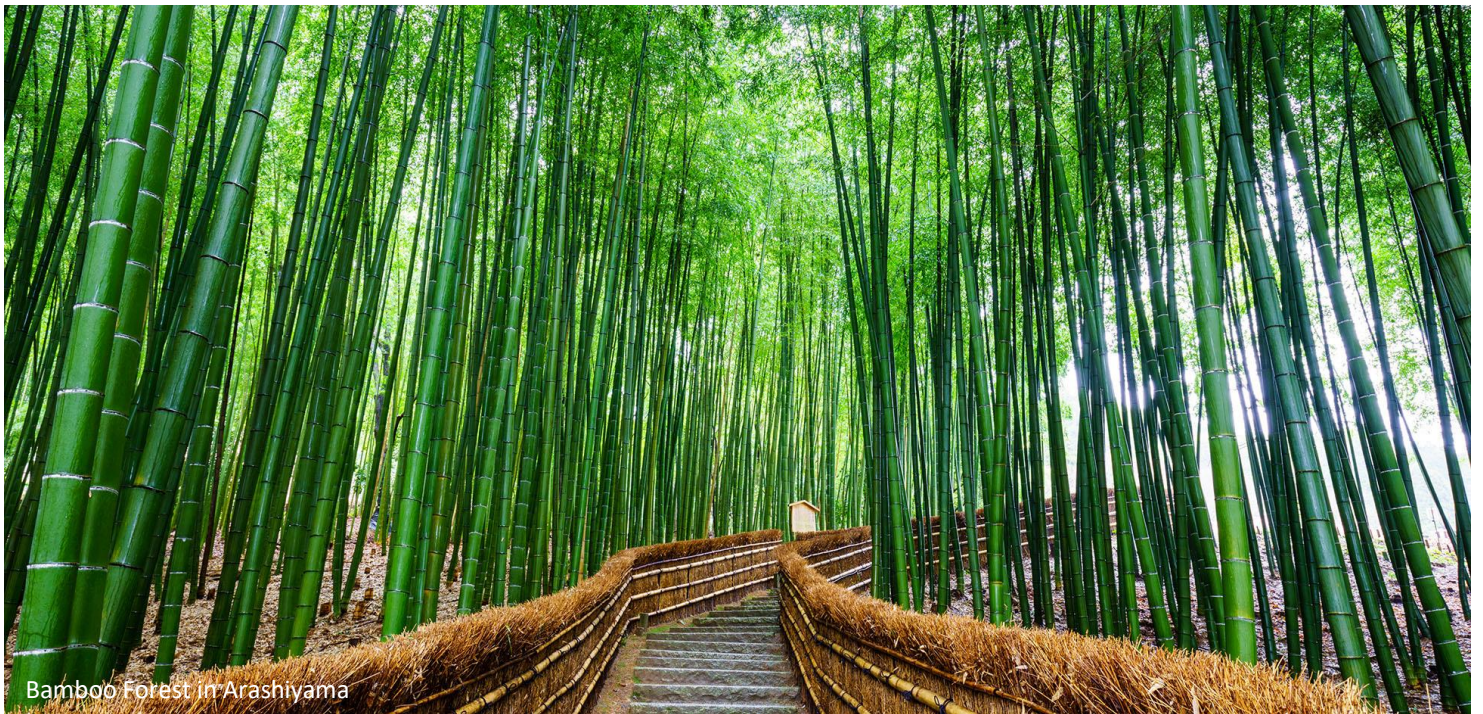
Bamboo Forest in Arashiyama