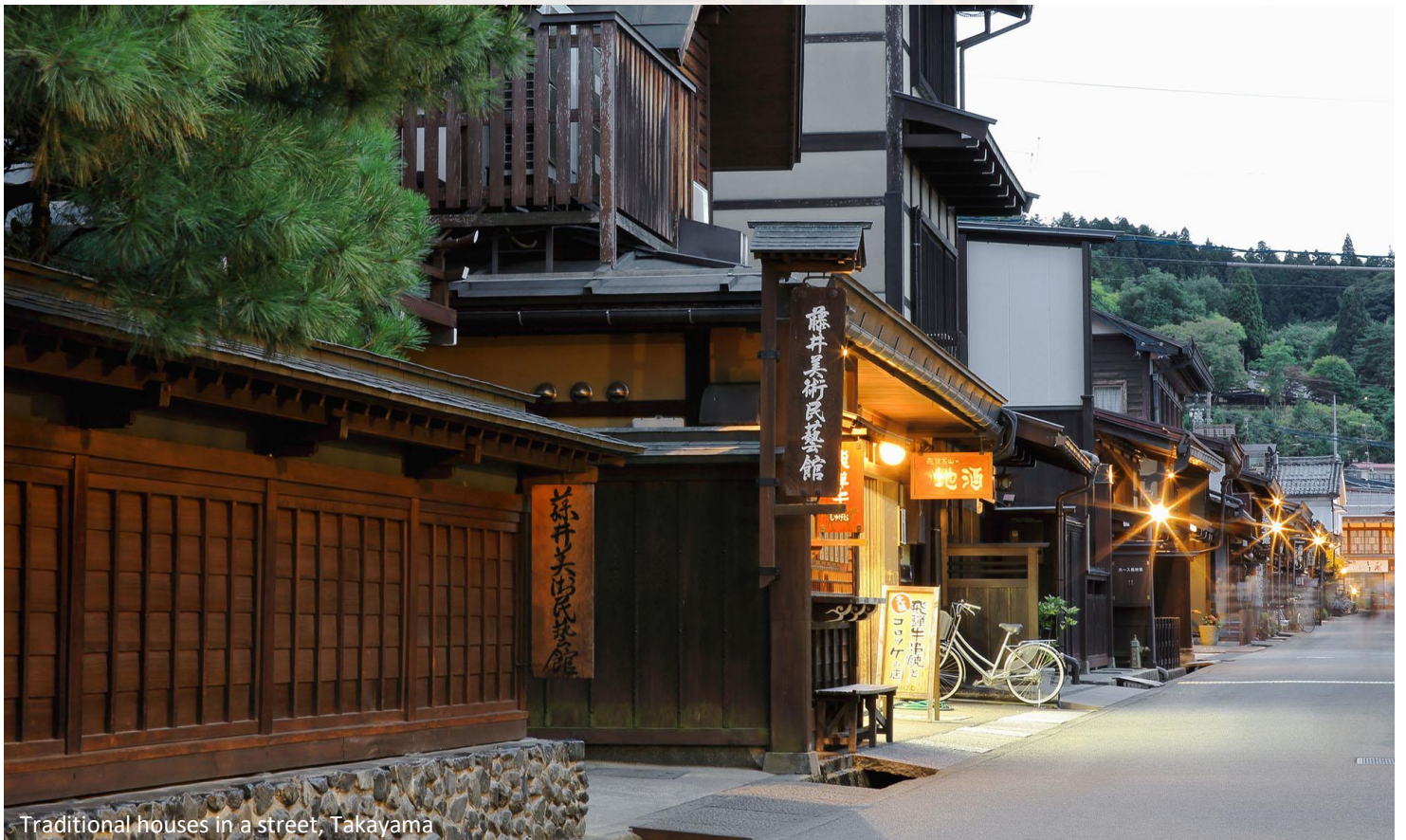
Traditional houses in a street, Takayama