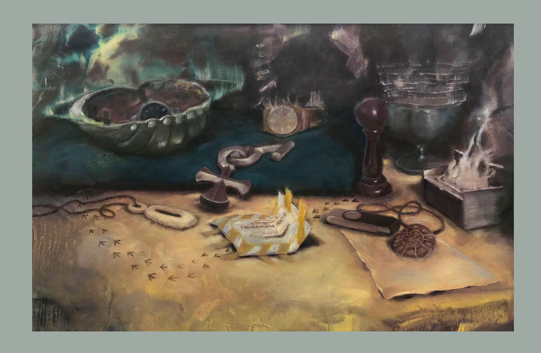
Stuff of Life 2021 oil on canvas, Tasmanian oak frame 54 x 87 cm $2,000