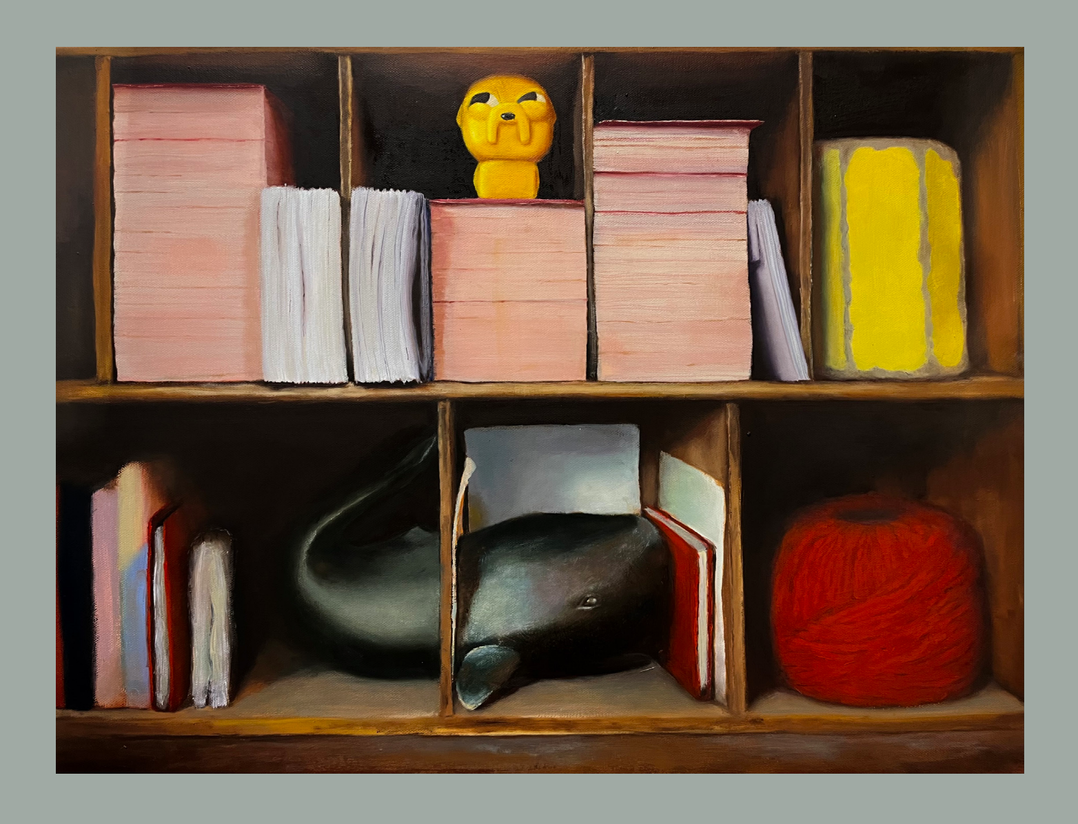
The Fly Lady 2022 oil on canvas, Tasmanian oak frame 65 x 48cm $2,000