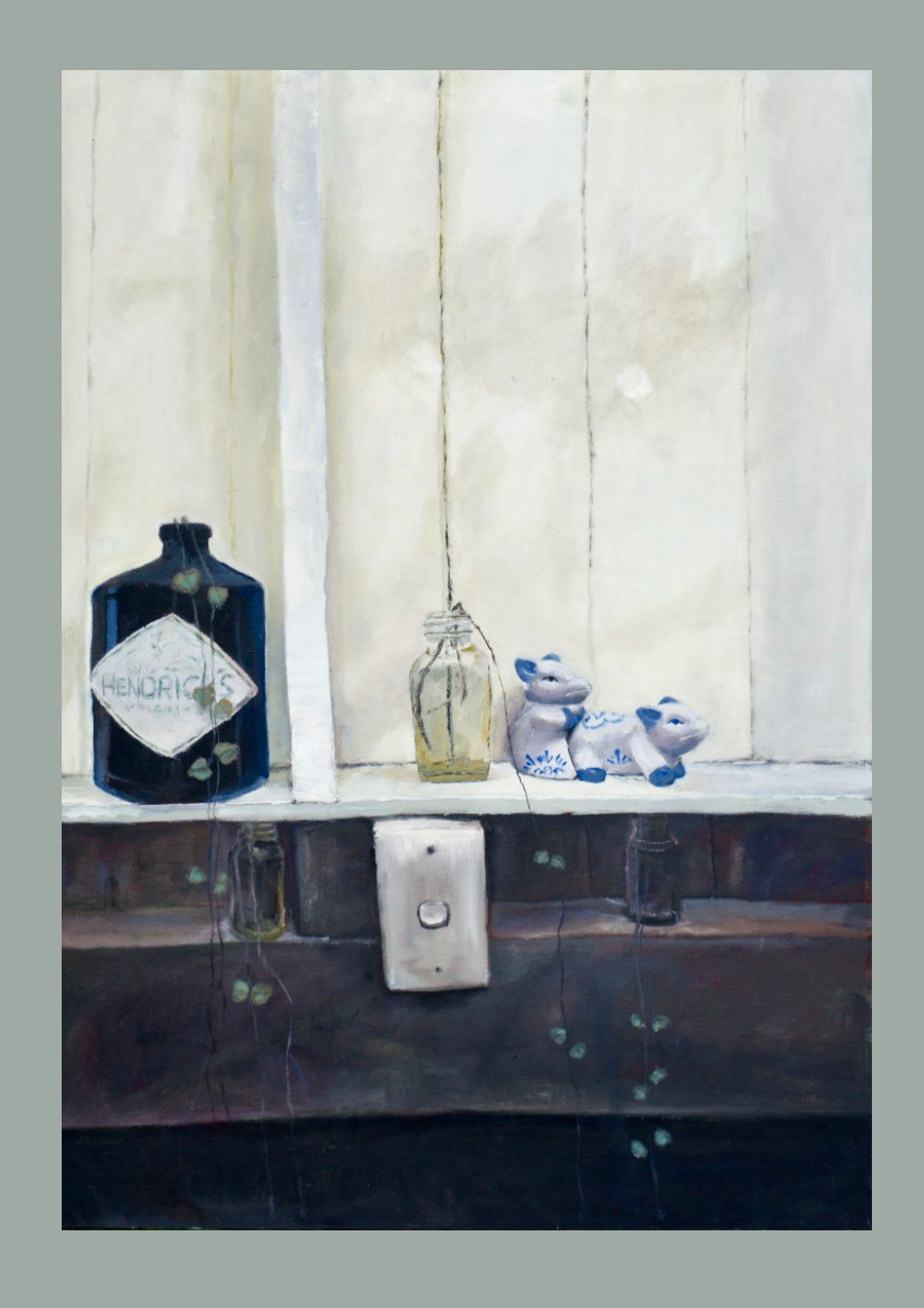
The Neighbour 2021 oil on canvas, Tasmanian oak frame 58 x 90cm $1,900