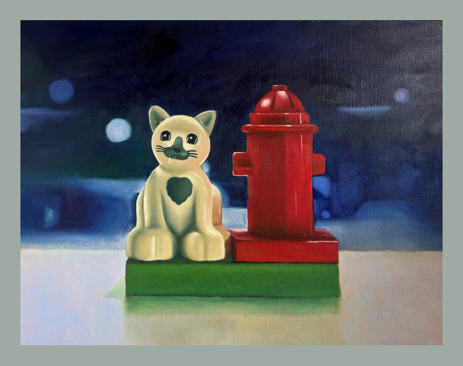
Lego Kitty 2022 oil on linen, Tasmanian oak frame 48 x 65cm $1,900