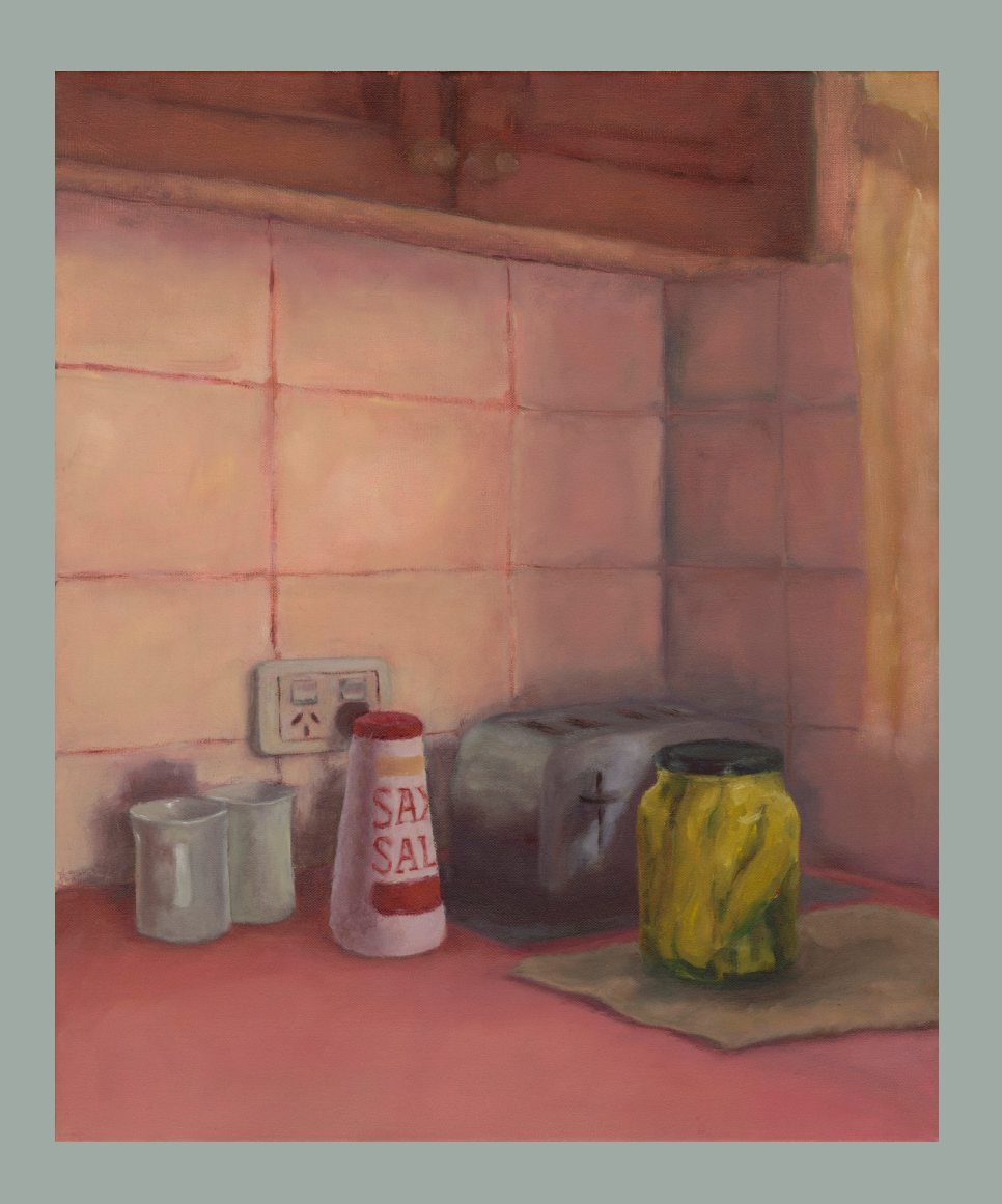
When are you Visiting your Baba? 2021 oil on canvas, Tasmanian oak frame 62 x 52cm NFS