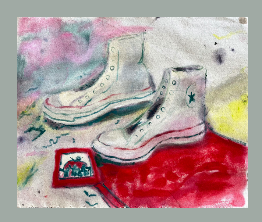
Shut Urp 2022 oil on canvas, Tasmanian oak frame 46 x 58cm $1,700