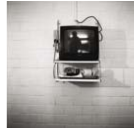
Darman Dillon (detail)