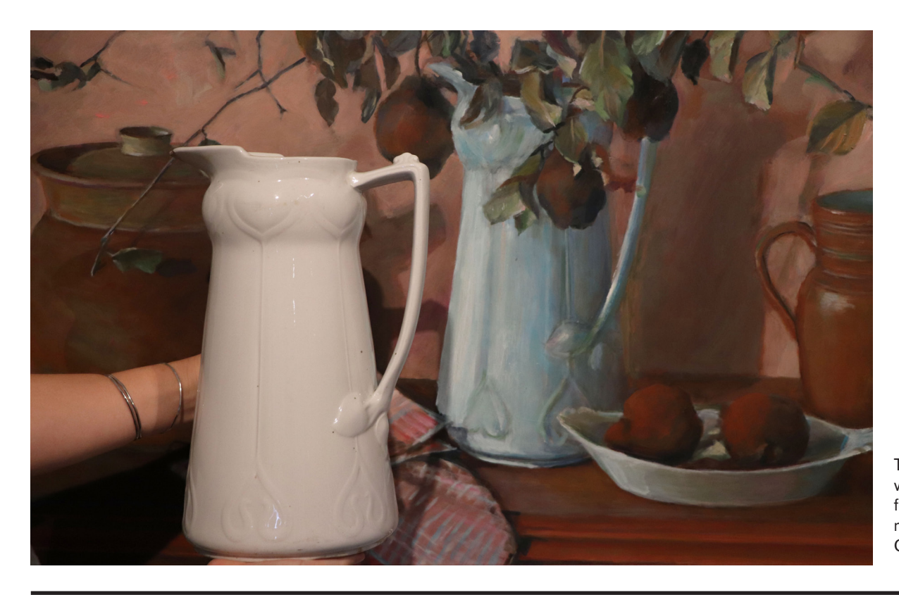
The striking white jug featured in this month's Still Life Challenge.