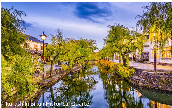
Kurashiki Bikan Historical Quarter

Morning visit to Koraku-en Garden . This quintessential Japanese garden was created roughly 300 years ago by the area's daimyo (domain lord). A symbol of the power of the samurai, Korakuen Garden is considered one of the three great gardens of Japan alongside Kanazawa City's Kenroku-en and Mito City's Kairakuen. Later take bullet train to Kyoto. (B)