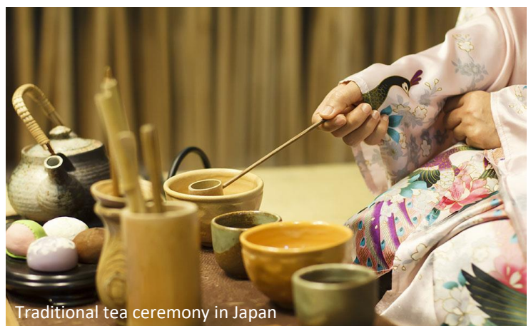
Traditional tea ceremony in Japan

This morning, we visit ceramic artist Kanjiro Kawai's House and the Kyoto Museum of Crafts and Design (formerly the Kyoto Museum of Traditional Crafts Fureaikan). Familiarize yourself with the techniques and history of local handicrafts, and admire exhibits covering dozens of categories and over 500 samples of traditional crafts. Next we visit the Temple of the Silver Pavilion, Ginkakuji , originally designed to be covered in silver foil but instead it's covered in black lacquer. Mossy woodlands border a groomed sand garden with a mound representing Mt Fuji. Tonight we enjoy a geisha show at Gion Corner. (B)