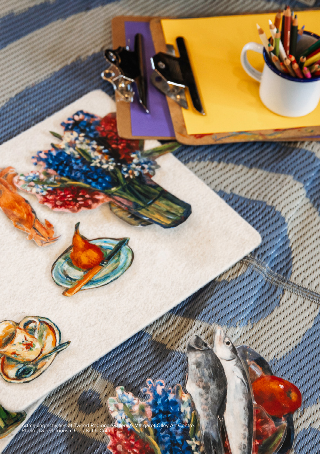
Artmaking activities at Tweed Regional Gallery & Margaret Olley Art Centre.