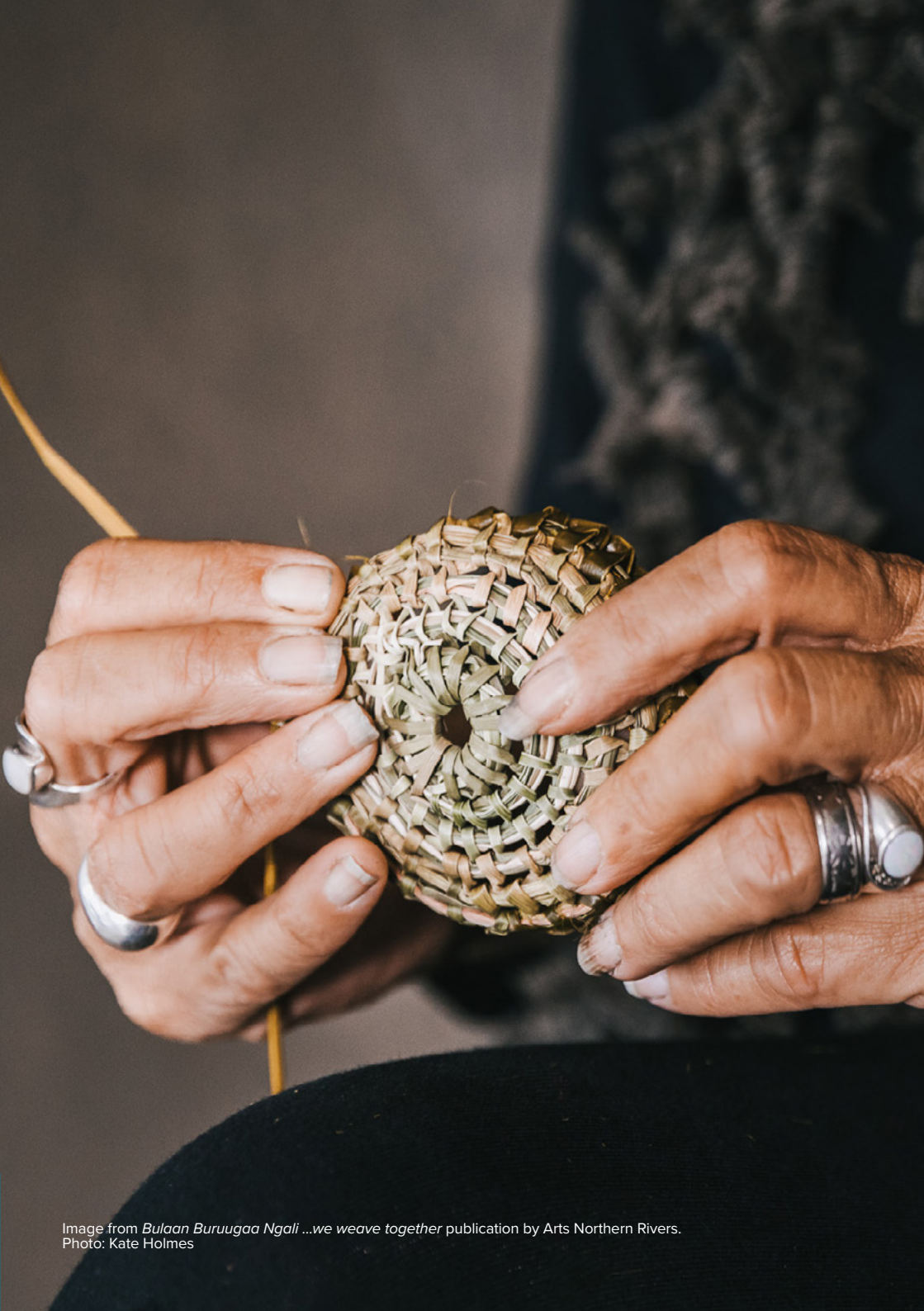
Image from Bulaan Buruugaa Ngali ...we weave together publication by Arts Northern Rivers.